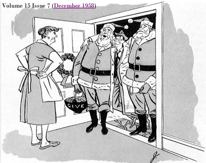
“You the party that wanted her old man home for Christmas?”