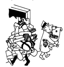
December 1964, Vol 21, No 7

Reprinted w/permission AA Grapevine, Inc